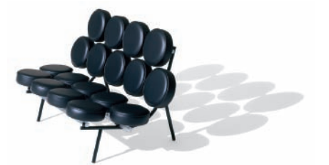
Nelson Marshmallow Sofa

Depth: 29" Width: 52" Height: 31" Seat height: 16"