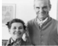
Charles and Ray Eames