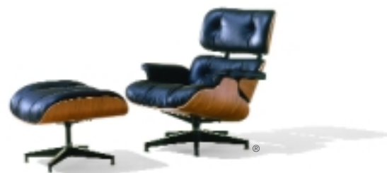
Eames Lounge Chair and Ottoman