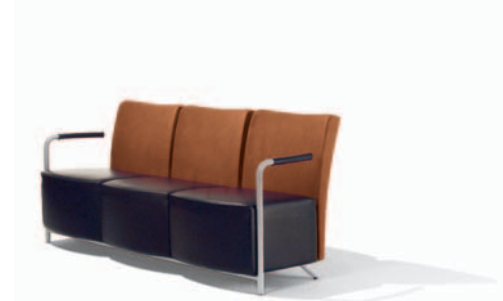
Celeste 3-Seat Sofa