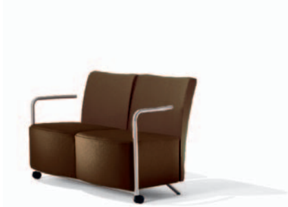
Celeste 2-Seat Sofa