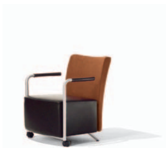
Celeste Lounge Seat

Seat, back, and even welting can be upholstered in matching or contrasting textiles or leathers, allowing the freedom to vary the appearance.